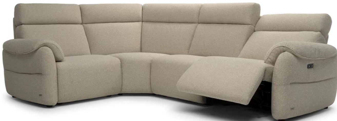
■ Vers. 272+076+291+F52