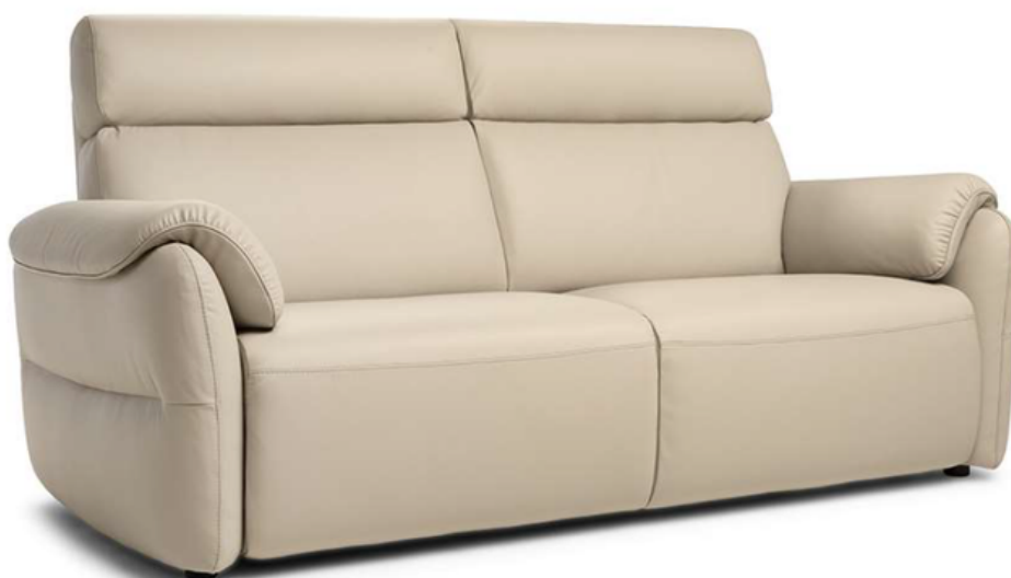
■ Vers. 009