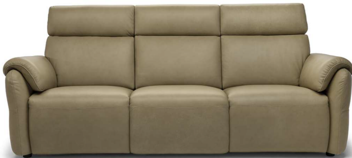
■ Vers. 155